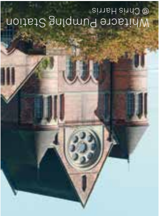
Whitacre Pumping Station