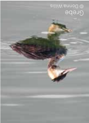
Grebe