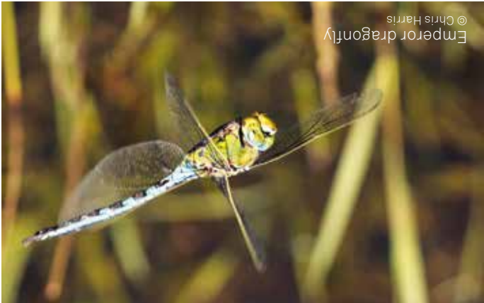
Emperor dragonfly

Explore the landscape, history and wildlife of the Tame Valley Wetlands. Stretching between Birmingham and Tamworth is an extraordinary, hidden landscape on the doorstep of over one million people.